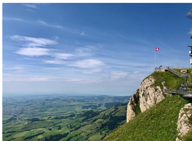
Weekend trip to Appenzell

Outside of work, the internship offered an incredible cultural experience living in Switzerland. The work culture encouraged a healthy work-life balance, making it easy to take vacation time to explore Switzerland and neighboring countries using the country's highly developed public transportation system. My coworkers were welcoming and patient as I learned German, and over time I achieved a B1 level, which was greatly appreciated even though I did not speak the local Swiss dialect. Through IAESTE-organized trips and the experience of adapting to a completely new country, language, and culture, I grew significantly as a person. Although living far from friends and family was challenging at times, the experience was ultimately unforgettable and one that I believe everyone should have the opportunity to pursue.