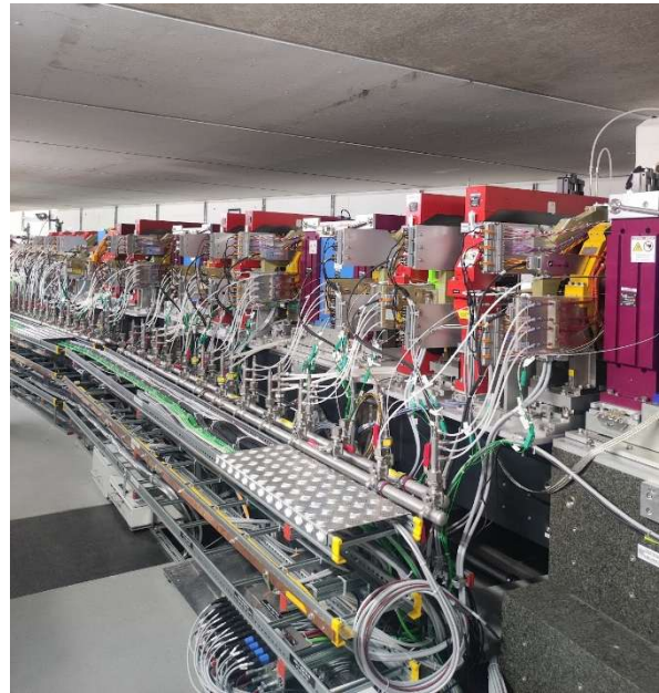
Swiss Light Source (SLS)

The Paul Scherrer Institute is a major research center in Switzerland. The accommodation was organized by PSI and was located close to work. I spent three months as part of one of the research groups there, and as a chemistry student, I learned so many new things. My project focused on photocatalysis. One of the highlights—besides working with a great team and meeting new people—was using the Swiss Light Source (SLS), a synchrotron, to measure my own samples. Another unforgettable experience was getting the chance to visit the SLS and SwissFEL during a shutdown. I mean, when else would I ever get to go inside a particle accelerator and see how incredible it is?