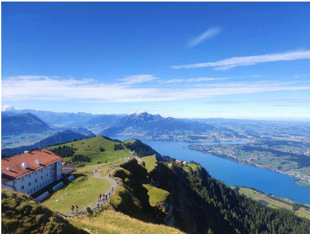
View from the Rigi, also known as the 'Queen of the Mountains' in Switzerland

All in all, this internship was a great experience both personally and academically. I had the chance to explore a new country, meet new people, and make new friends. At the same time, I learned a lot for my future career as a researcher. Finally, I want to thank IAESTE for this amazing opportunity.