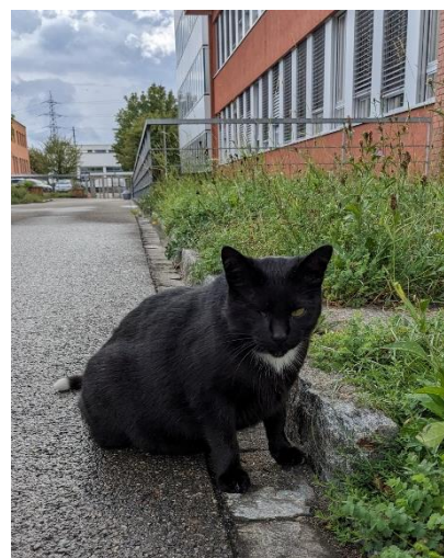
PSI cat "Jipie"