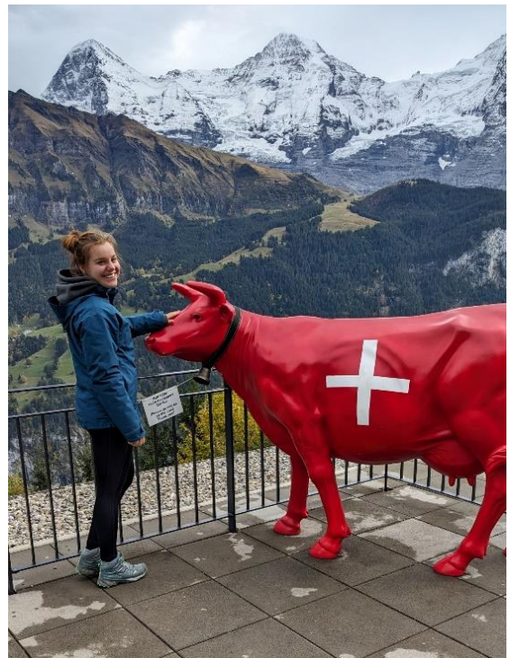
Me, with some of the biggest mountains of Switzerland (Eiger-Mönch-Jungfrau)

All in all, my time in Switzerland was an amazing experience that I wouldn't trade for anything. A huge shoutout to all the incredible people I met along the way, who made my stay one of the most unforgettable and cherished memories of my life.