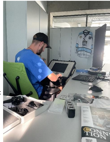
me working on the portable testing kit

Our group of interns, made up of individuals from four different nations, cultivated an atmosphere of diverse viewpoints and captivating exchanges, particularly at our regular meetups in a nearby pub. These dialogues offered valuable perspectives into the important nuances of culture that shape opinions on contentious issues.