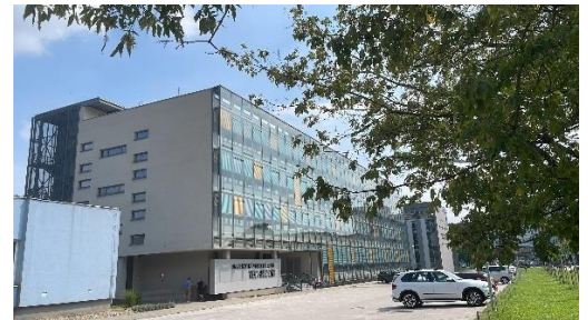
my office was located at a start-up hub, built by the university