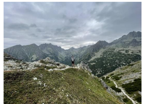
we did some hiking in the Tatra mountains