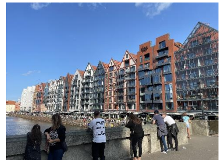
looks like Amsterdam, but it's Gdańsk PL