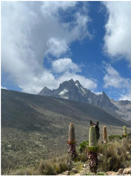
Mount Kenya Vista: Captured at 4,000m Altitude

My journey to Kenya was facilitated by IAESTE Switzerland, an organization that presented me with this incredible opportunity. Their supportive team was consistently available, addressing any questions or concerns I had. Their presence offered a sense of security, knowing assistance was always within reach. Fortunately, my internship proceeded seamlessly, with everything unfolding as anticipated.