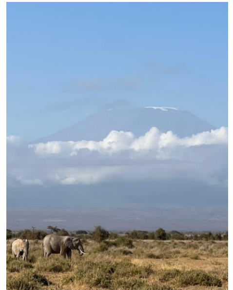
Dawn Over Kilimanjaro: Elephants in Amboseli's Morning Glow