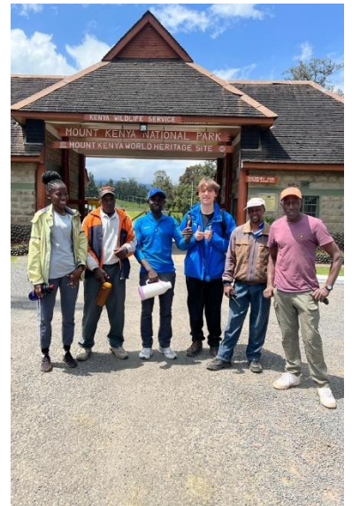
Pre-Hike Moment at Mt. Kenya's Base; Altitude 2700m

One of the most challenging moments during my stay was my attempt to conquer Mt. Kenya. With a local guide from Nyeri, along with a team of porters and cooks, we embarked on a four-day expedition to scale Africa's second-highest mountain, following Kilimanjaro. Despite being my maiden hiking experience, the expedition was demanding. We would retire to our tents early each evening, only to rise with the sun. Though the summit stands at 5,000m, I reached a commendable altitude of 4,300m before succumbing to altitude sickness and had to turn back. During this adventure, I had the pleasure of meeting fellow travelers, including some French individuals. This endeavor, though I didn't reach the summit, sparked a newfound passion in me: hiking.