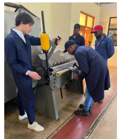
Crafting a Mould with My Team

My work abroad offered me a fresh perspective on the role of engineers. Unlike in Europe, where engineers predominantly confine themselves to office spaces, here they oversee projects from inception to completion. A case in point was when we drafted 3D models of a solar dryer and subsequently oversaw its construction on a local farm. This transition from conceptualization to practical execution was grueling but enlightening, highlighting the complexities of fieldwork.