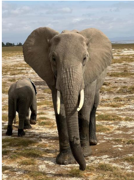
"Mother and Calf: An Elephant Duo in Amboseli National Park"