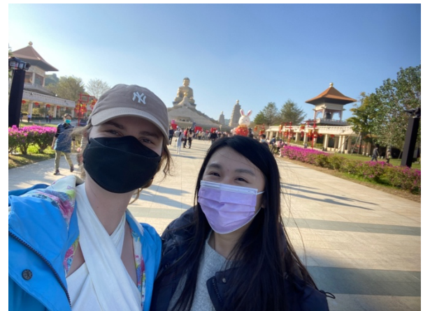
Visiting a buddha museum with my coworker