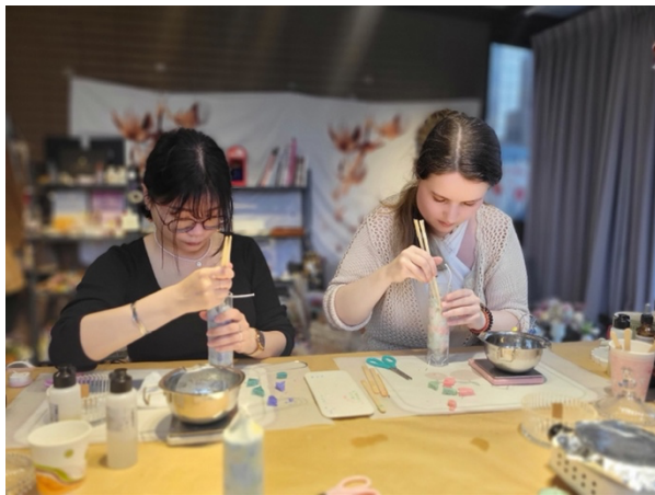
Candle DIY class with my Chinese teacher

An aspect that largely contributed to my positive experience during my internship were the people that I met. My coworkers/friends always tried to help me out if any issues arised in my daily life and invited me to some weekend/day trips to show me different parts of Taiwan.