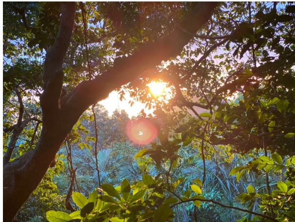
Sunset hike around Kenting (south of Taiwan)