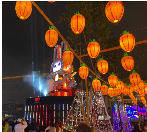
Lantern festival in Taipei