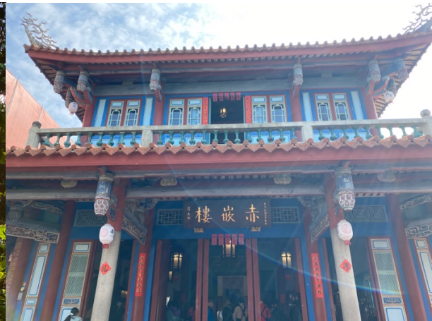
Chikan Tower in Tainan