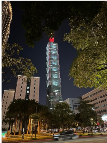
101 Tower in Taipei

My favorite place in Taiwan was the east coast. Since this place is known for its beautiful nature, you can go hiking in the mountains or swimming, surfing,... on the numerous beaches you can find.