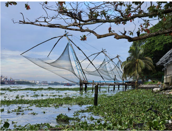
Figure 6: Chinese fish nets in Cochin

I thank IAESTE Switzerland infinitely for allowing me to have this experience, and also for all the help offered and also answering my numerous questions by email. They were very helpful and willing to help me through the whole bureaucratic process to file the necessary documentation. I would also like to thank the hosting team of IAESTE Karunya who from day one went out of their way to integrate me and played crucial roles in cushioning the culture shock with the Indian world. They also gave me invaluable advice on places to visit and other tips during my weekend trips. The work experience was all in all good considering that the bulk of the internship could not be fulfilled, and it enriched my future career and will definitely come-back to me in my work curriculum.