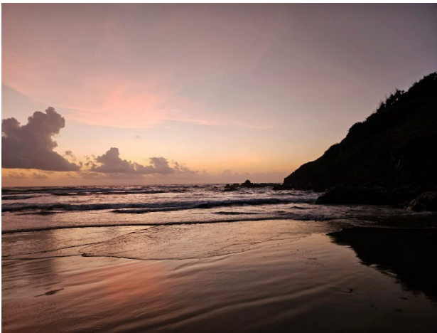
Figure 3: Sunset in Vagator, Goa

sea and in big cities where I really had the impression of getting to know Indian society.