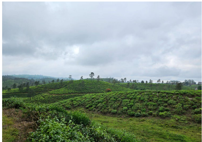
Figure 2: Tea plantations in Valparai

the students inside the university campus, which is relatively isolated from everything and so during the week besides work there was not much to do, however every weekend on Friday after work I would take my backpack and leave for two-day trips to other places in South India, where I had wonderful experiences in the mountains, at the