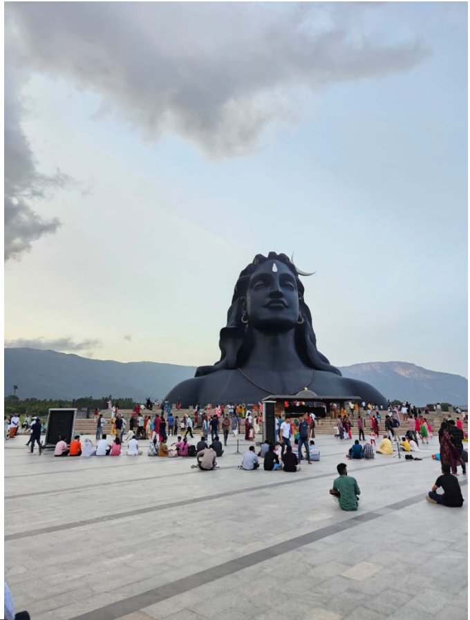
Figure 4: Bust of Shiva at Isha Yoga Center

Regarding the culture and the host environment itself, I would have so many things to say but if I have to be synthetic, I can say that it was a fantastic experience and for me it almost felt like being on an alien planet, as I have never had any experiences of traveling to Asia in general and I feel that Indian culture is just the opposite in some aspects compared to European culture. Precisely this was one of the aspects that I enjoyed the most about the whole experience as every day was a new discovery as far as social behaviors where people possess a tranquility and calmness sometimes inconceivable in the face of the chaos of Indian life, the culinary specialties that are mainly based on rice and chicken and other foods where they put spicy and chili even on mangoes (in the end I got used to it very well and even now on my return home I continue to eat a lot of spicy). Unfortunately during the work week I was only solely in contact with