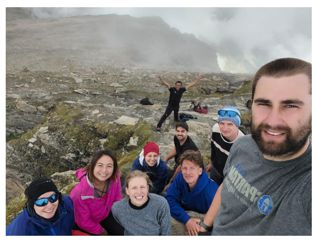
I am grateful for the opportunity I had to do the internship in Switzerland. I really enjoyed it a lot and made great friends while I was there.