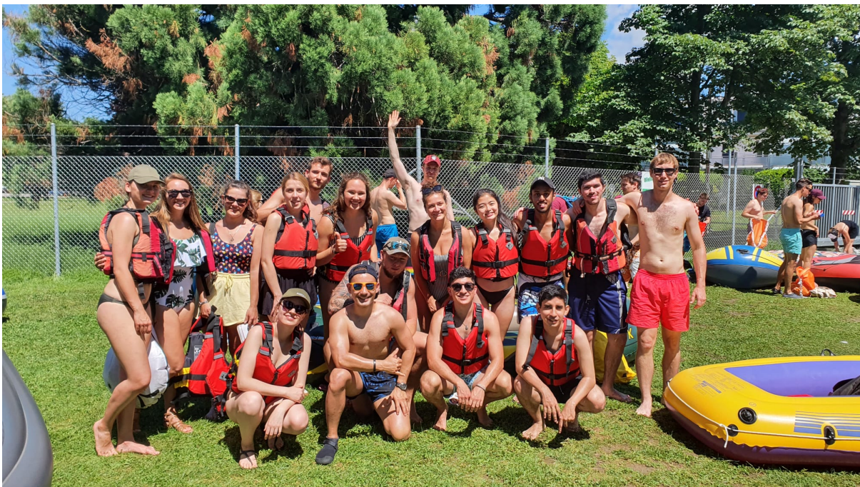
Bern Rafting Day - 12 July 2020

The most amazing things IAESTE did were the weekend events. Due to COVID-19, they had to cancel a lot of them, but the very few they organized were incredible. I was able to visit some places in Switzerland, and had fun times with fun people.