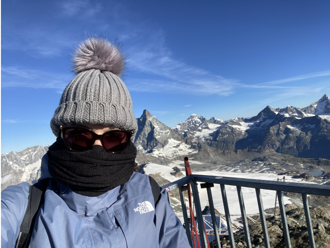
Freezing at Klein Matterhorn