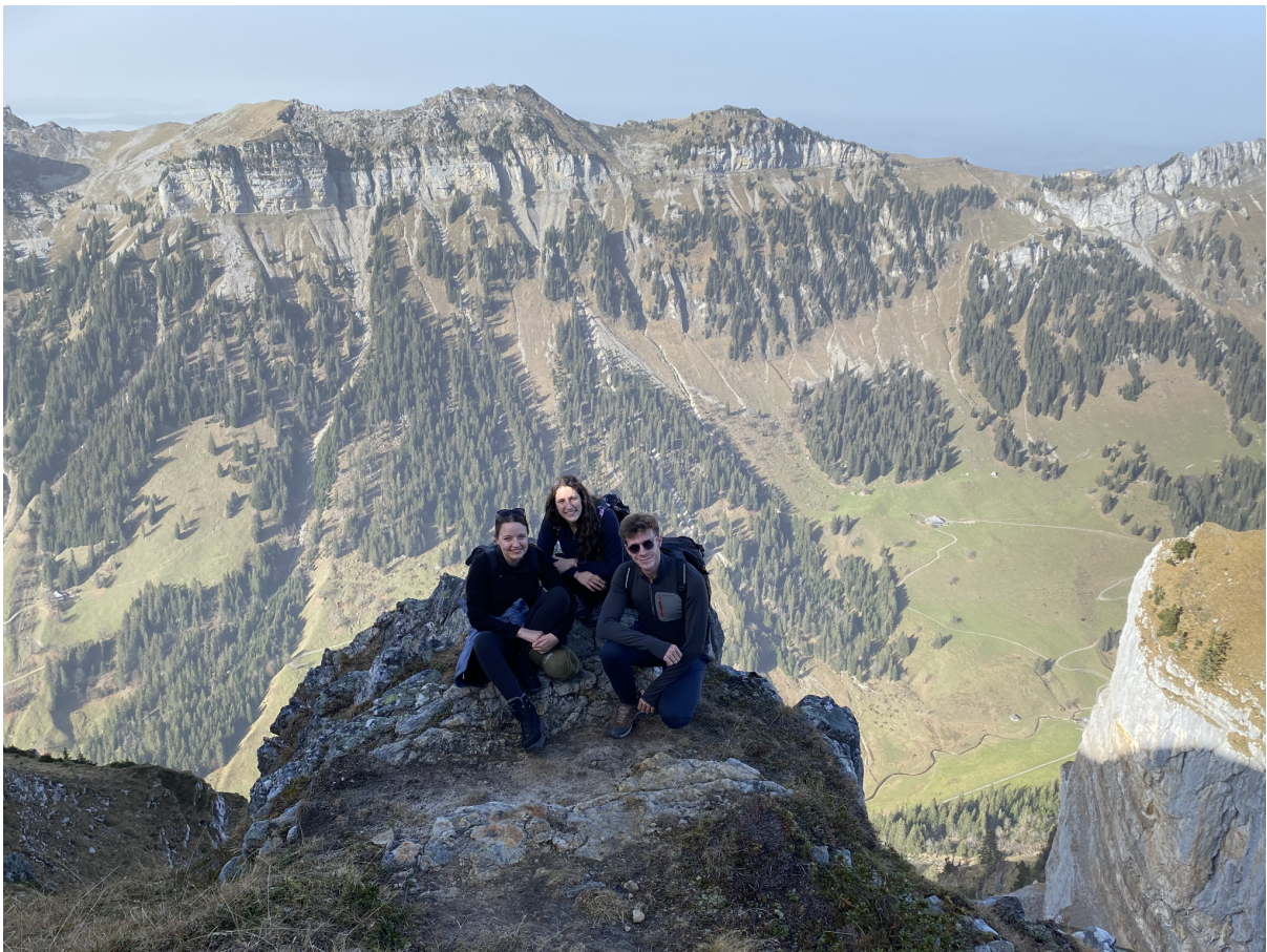
Interlaken hiking with two argentinians

I also made some trips all around Switzerland with other IAESTE interns, and also a few with my floormates and a work colleague.