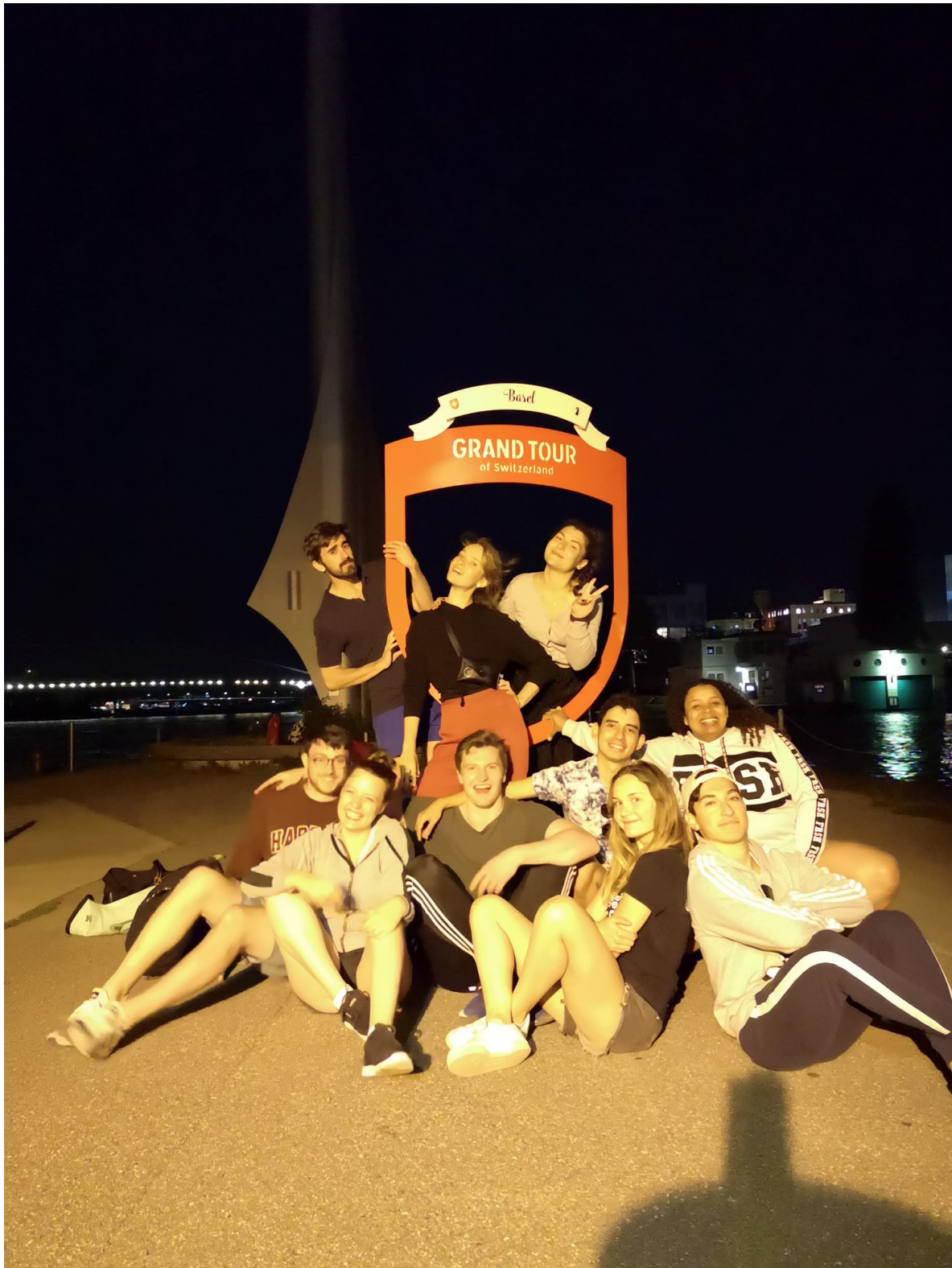
Basel Day - 5 September 2020