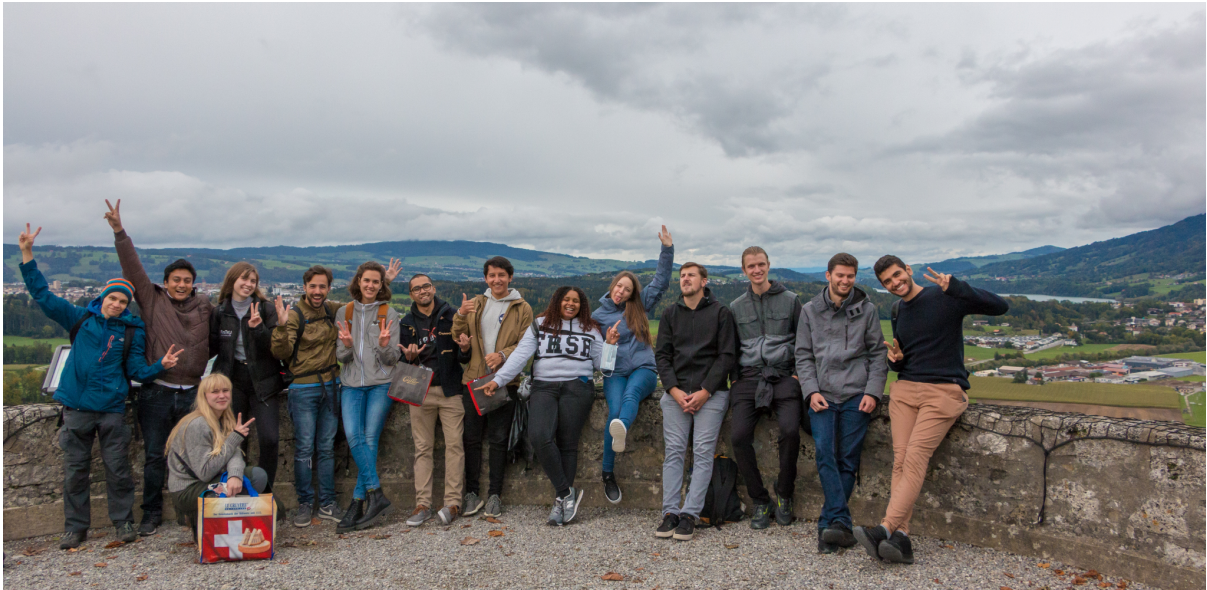
Chocolate and Cheese Weekend - 27 September 2020

I also made some trips all around Switzerland with other IAESTE interns, and also a few with my floormates and a work colleague.