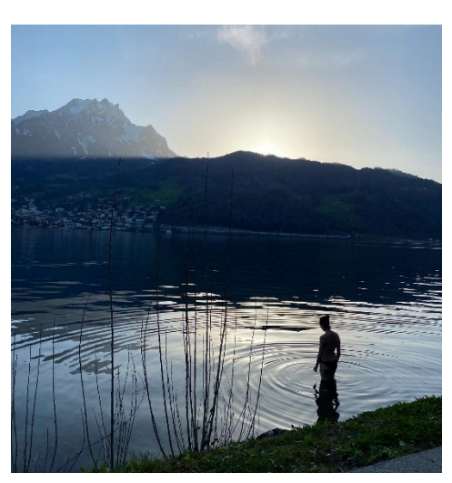
Dipping by Mt. Pilatus