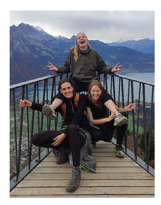
Interlaken ridge hike