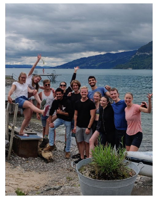
After SUP-ing in Thunersee