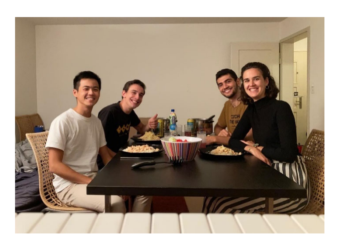
My second room in Winterthur