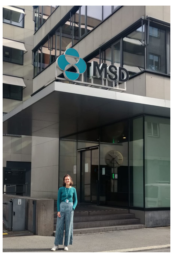
At the former MSD offices - when restrictions allowed us to go to office

Those months of internship provided me with the background and trainings needed - SAP ERP system training was provided- to slide smoothly to my new role as a Supply Chain Specialist. This ERP platform is used to trace different raw and final products during their respective supply chains as well as how the movements between production side and final market.