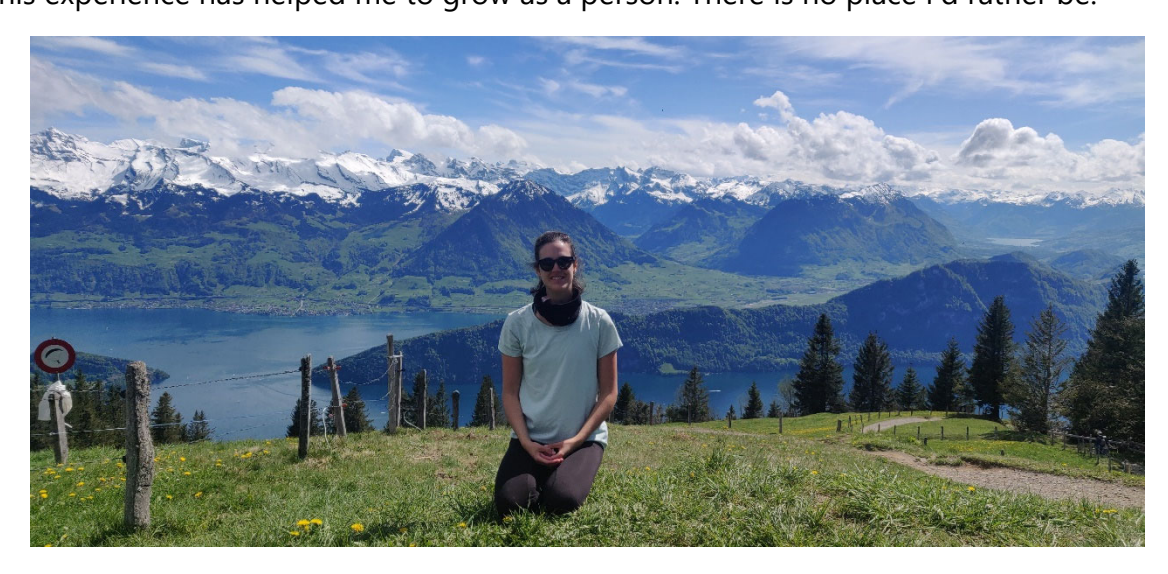
Views from Rigi

This experience has helped me to grow as a person. There is no place I'd rather be.