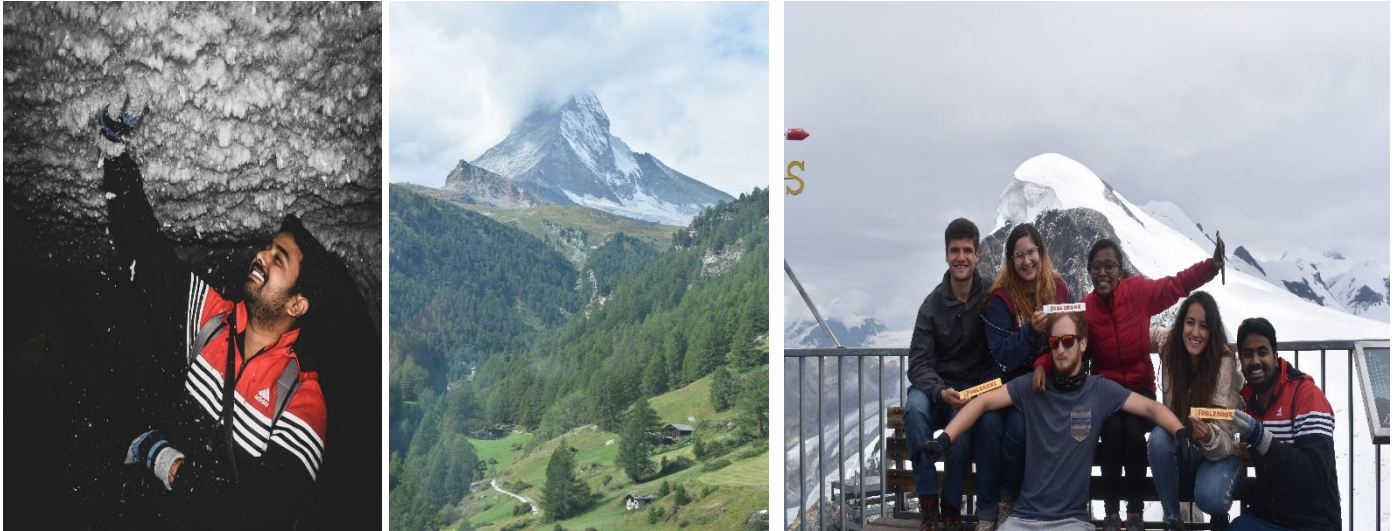
(From left to right) Inside the Glacier Palace, The Matterhorn from Zermatt, our squad having fun with Toblerones.

The International Zurich weekend was first weekend that I had attended. It was lot of fun walking around the streets of Zurich and getting to know different places and of course the IAESTE dance at ETH Zurich was a memorable one. My favourite weekend was the Zermatt weekend. I was so excited to be there as it was my first experience with snow. Though the hikes were very difficult (six hours hike) the views from the top are worth it. Having a bite of Toblerone while enjoying the view of the might Matterhorn was simply astounding. During my stay for three months in Switzerland I had been to around six hikes. For a person who never went on hiking this is definitely a big thing.