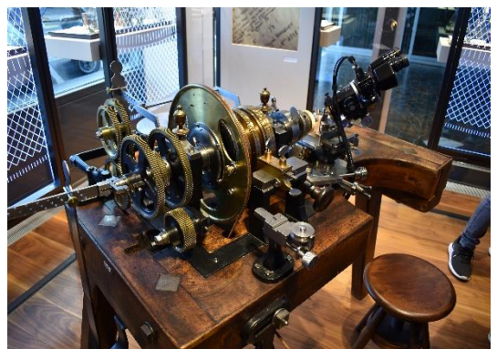
(From left to right) United Nations European Headquarters, one of the conference halls and traditional watch carving machine at Breguet.