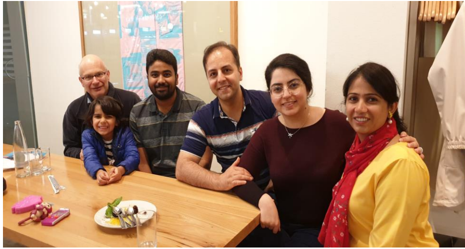
Group Picture during my Farewell Dinner in Basel.

Culturally I would say India and Switzerland are similar in terms of people of various ethnicities and usage of different languages. During one of the IAESTE weekends (Cheese & Choc Weekend) I had the opportunity to visit Cailler Chocolate Factory at Broc and a traditional Swiss cheese factory in Gruyeres. The visit brought me closer to the Swiss culture and it was also the first time I had the Cheese Fondue.