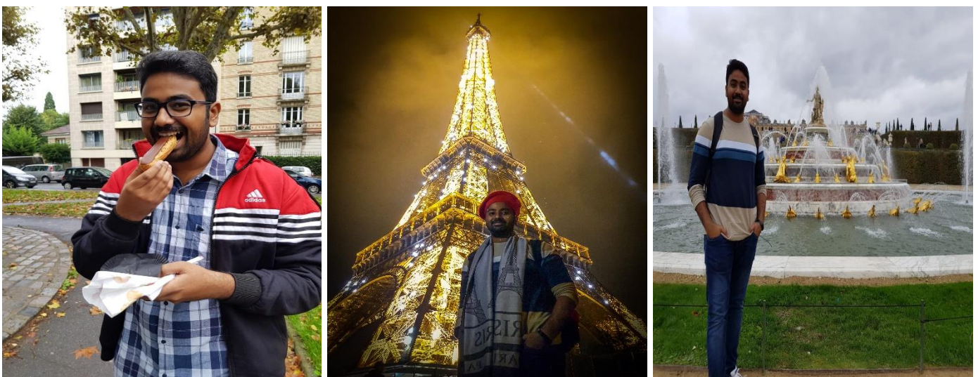
(From left ot right) Enjoying an Éclair, Eiffel Tower at Night and central fountain at the Palace gardens in Versailles.

Also I had the opportunity to visit world class institutions such as ETH Zurich and EPFL during their open days. I had a lot of exposure to the ongoing research in my field over there. I wish I can be a part of those in the near future. I had travelled to Paris with my IAESTE friends which was an amazing experience. This trip was on bucket list since I was a child. We had lot of fun on the streets of Paris, eating macarons and éclairs, dressing up as Parisians and of course lots of pictures for Instagram.