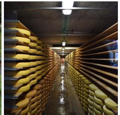
(From left to right) Chocolates at Cailler Factory, Cheese factory workers playing Alphorn wearing traditional clothes and shelves of cheese.

The Geneva weekend was a different experience. From being at the United Nations to the Philippe Patek Clock museum and the Breguet watch store, it was truly an awesome experience from which I understood why the Swiss watches are so famous.