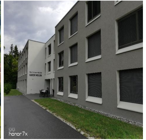
(From left to right) Paul Scherrer Institute – Villigen, Guest House.