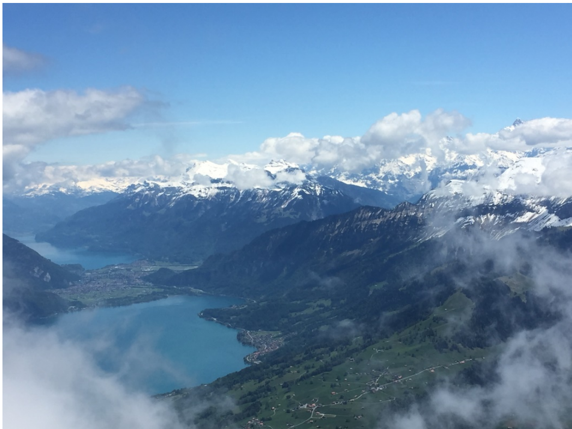
View on top of Mountain Niesen

Although I have travelled in many European countries before coming to Switzerland, I was surprised at the high standard of Switzerland, fabulous landscape and high living costs. In such a small country, there are still 4 different official languages, and the policies can be very different among the cantons. I really enjoy the fresh air, majestic mountains and beautiful lakes in Switzerland. The most valuable things are that I work hard to my limits in the new environment and meet so many kind people from different countries.