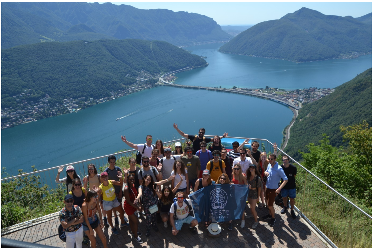
Group photo of IAESTE Ticino weekend in Lugano

I am really grateful to IAESTE for providing this great internship opportunity for me. IAESTE supported me during the application for the internship and working visa as well as the preparation before the work started. Also, during my one year in Switzerland, there were many trips organized by IAESTE. I joined two weekend activities, Geneva weekend and Ticino weekend. The weekends organized by IAESTE are not too expensive and give trainees good opportunities to discover Switzerland and meet other trainees. Although the participants were totally different during the two weekends, IAESTE spirit is the same and both the activities were well planned. I have good memories of the trips and was happy to meet all the international trainees.