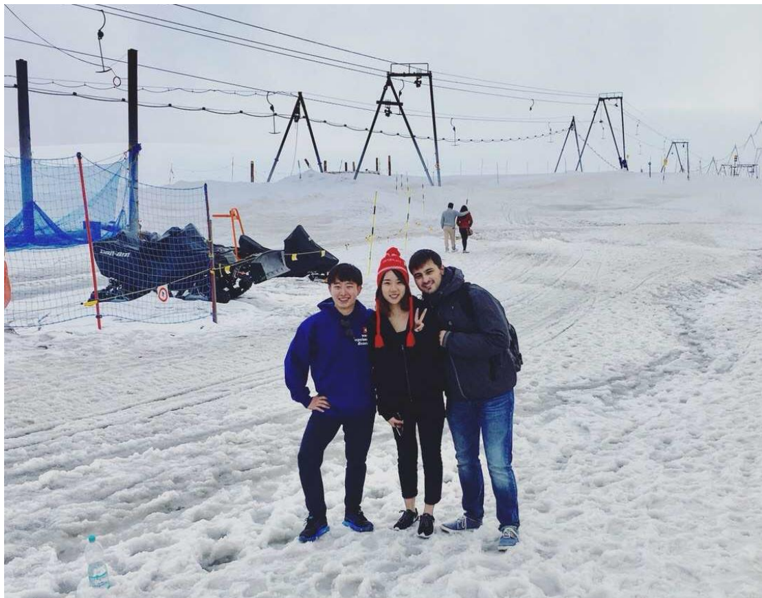
Weekend trip in Zermatt organized by IAESTE

I think the best part of this whole experience was the people you meet along the way. You get to meet new people from countries around the world whom you would have never met in your daily life , you're exposed to different cultures, you see different landscapes and views, you experience new things you learn the world is diverse and it helps you understand people that are different from you. I believe that what IAESTE would bring to you is not only the chance to work abroad, but also the great opportunity to see the world, to leave your own comfort zone and to be able to think out of the box.