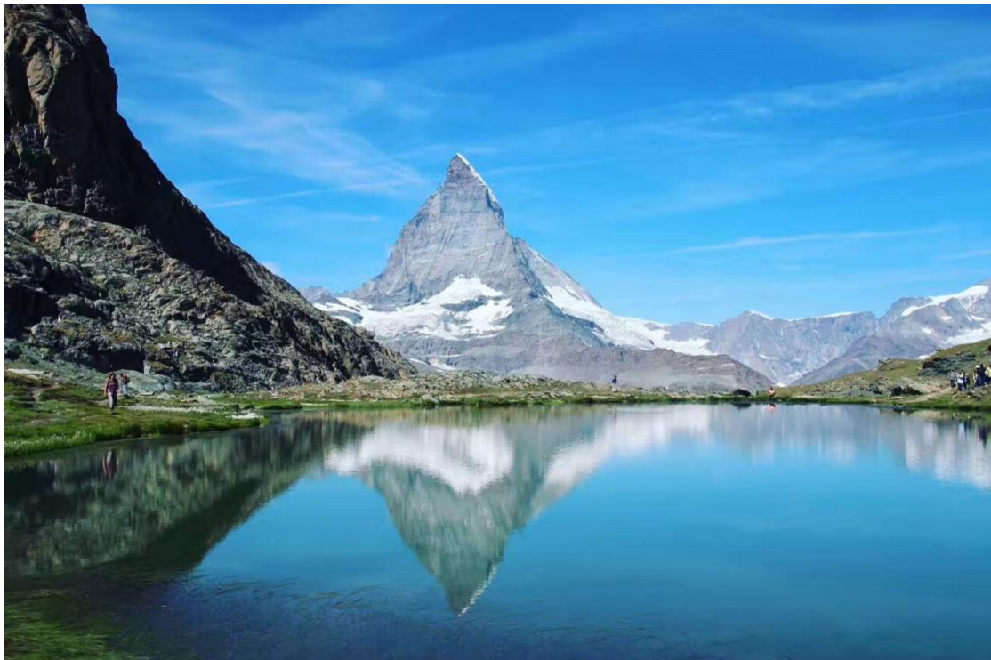
Hiking camp in Matterhorn

Before came to Switzerland, I had been to several places of Europe, but nowhere else could provide you with such unique landscape and amazing experience. I used to spend most of my time stay indoors, now the lifestyle here also transformed me to become totally outdoor enthusiast, whenever I got the time, I would like to go hiking in different mountains, cycling along the lakes or go skiing in the winter season. Apart from the beautiful views, the people I met here was also friendly and easy-going, who's willing to share their lifestyle and present their country to you.