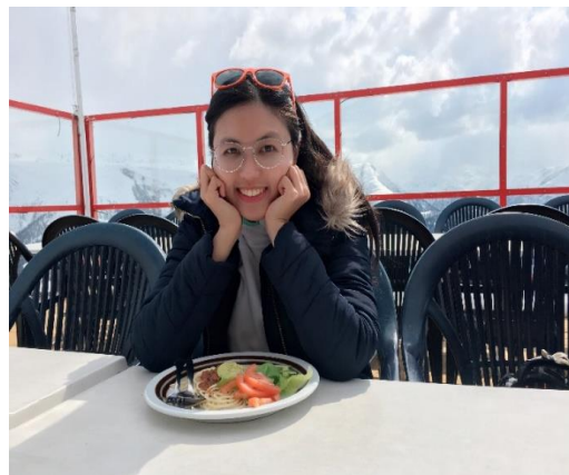
Company trip on Swiss Alps

Switzerland itself is quite small and its transportation is very convenient, so you can make trips everywhere. If you love sightseeing, you should definitely go to Bern, Geneva or Zurich. Those places are just breathtaking at the first sight. Besides, there are still many amazing and beautiful places in Switzerland.