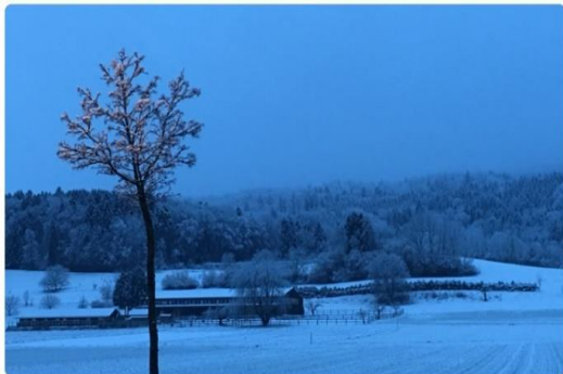
My memorable 2-season internship

The weather seems like "it's not my cup of tea". That's obviously true because you could never know what would happen. It could be sunny then spontaneously raining and snowing on a day. It's totally worth experiencing one of the most intriguing and charming features in Switzerland.