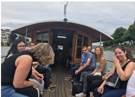
QS-E's day in Basel