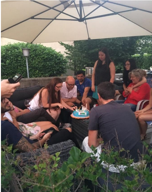
Party at colleague's house