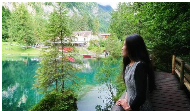
Blausee in Bern

I was really impressed by the enthusiasm of IAESTE Organization. They helped me at the very first steps as sending my resume to company, summiting my visa and arranging my accommodation in Switzerland. There were weekly meetings as well as monthly trips organized for IAESTE members. By these ways, I could get to know many friends from various countries. For sure, you would have wonderful time together at bars or lakes.