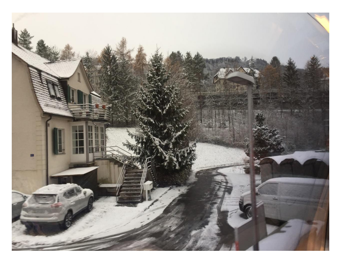
Figure 6 My first snow in Zurich