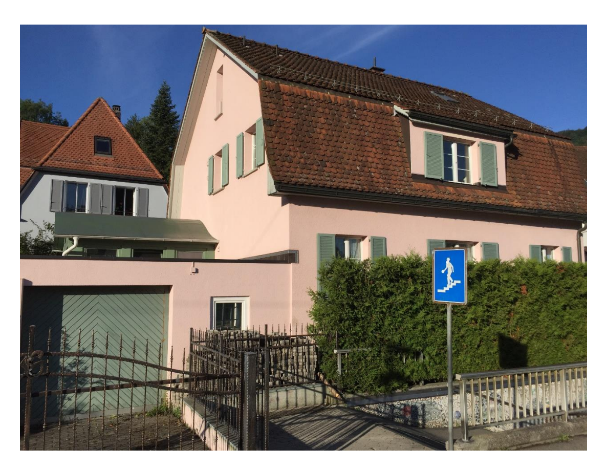
Figure 3 The place I lived in Switzerland

In my case there indeed exists some differences about living hobbies, but it is not hard to adapt it. Any questions I would ask my roomie or negotiate with my landlady.