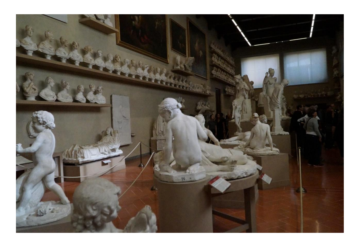
Figure 4 Art exhibition in Rome