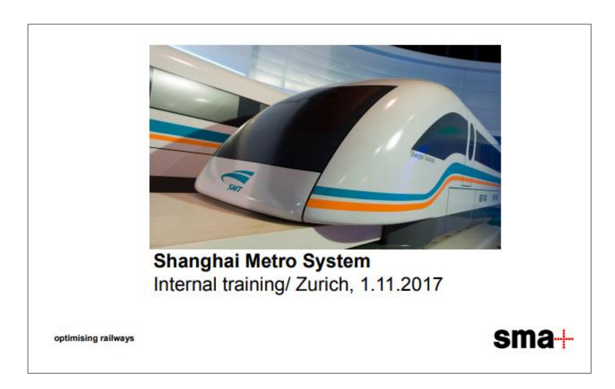
Figure 1 Shanghai metro presentation slide

kind of enjoying people kept skeptical about my statement. Actually, I do not feel shame because I know of which is what I lack.