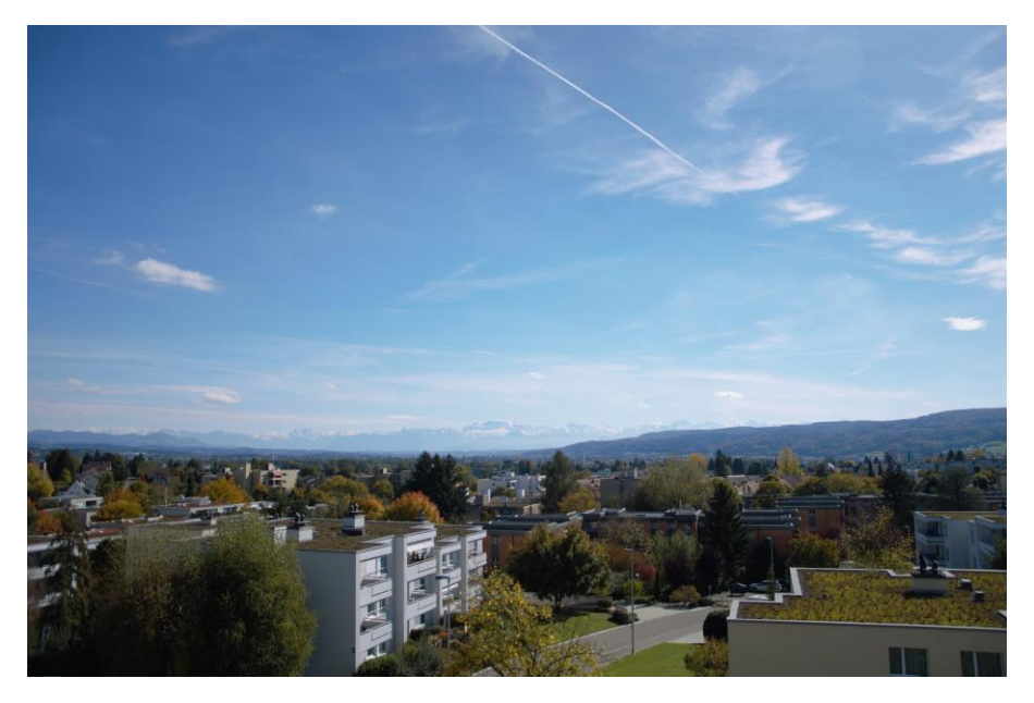
Wallisellen, View from house balcony

which changed me as a person, made me a lot more open minded and maybe made me see some things differently.