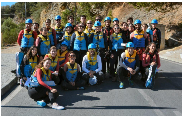
Figure 2: Part of the Drug Product Development Department during the Team Building Activity

Hovione is situated in a village next to Lisbon with limited access by public transport. But the company has a bus only for its employees that picks up the people in Lisbon and brings them to Loures. So, we could take the bus quite close from our flat to get to work. I was part of the Drug Product Development Department where I assisted my supervisor in one of her projects. On my first day, I got some instructions and had a security training. The next days were quite improvised as nothing really seemed to be prepared for me. My supervisor needed to prepare my working plan and I spent the first working hours waiting for a computer and instructions to the project. Once, my supervisor was ready and I finally had a computer with internet access, I started with a Literature Review and a short presentation. As the material and equipment wasn't ready when I needed it, we extended the Literature Review and I ended up with reading for 1.5 months. When things finally were ready, it was quite exciting to start the work in the lab. It was very interesting and I felt that the work