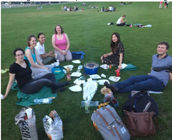
First meeting with LC Basel members. Here I discovered "Rivella" for myself ☺

IAESTE helps students not only to train and practice their skills of their speciality, gain experiences and learn new things, but also to travel and earn some money. All meetings and weekends are unforgettable and awesome! They help to get trainees close; to exchange with our work and life experiences; to meet people with common aims or lifestyle. That's really the most exciting and amazing part of internship. For me IAESTE is studying, travelling and friendship. And it will be hard to forget this incredible summertime with IAESTE!