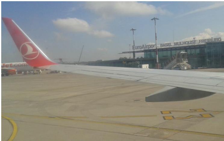
Full of worries and courage before landing to Basel

Basel it's not only one of the biggest city in Switzerland, but also the city situated in the borders of Switzerland, Germany and France. So there is a chance to have Swiss breakfast, German lunch and French dinner in one day in three countries☺.