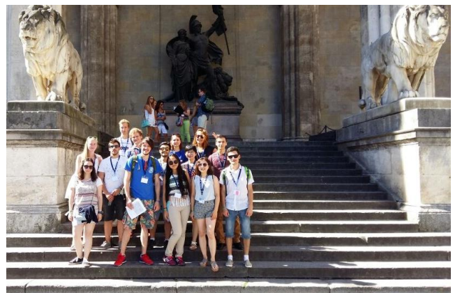
Munich Weekend with 150 IAESTE people from everywhere