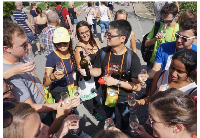
Wine Trial Weekend. From Sierre to Salgesch