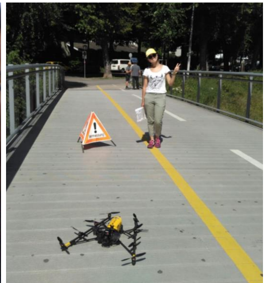
Photogrammetry measurements with the drone