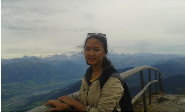
There is no need for words. Just feel the mountains..

Alps are gorgeous. They calm you down and make all worries and fears disappear.