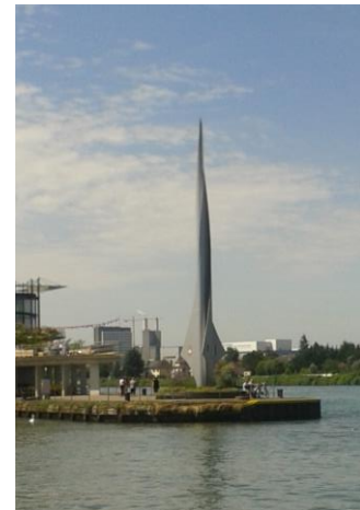
The point of 3 countries