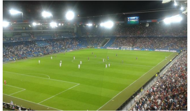
The moment when everyone has one aim