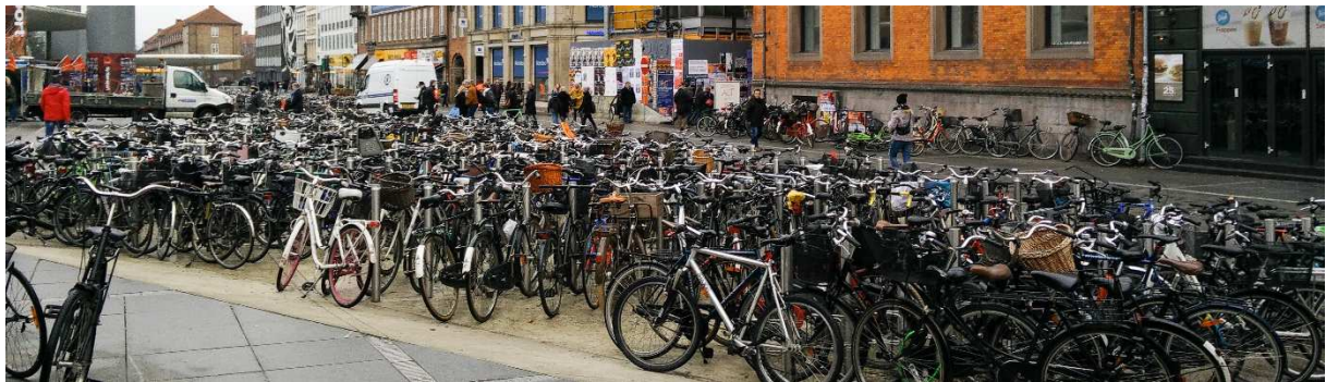
Bikes, bikes, bikes and more bikes all over Norreport station.

My IAESTE-internship was a very enriching and unforgettable experience, which I would highly recommend to anyone searching for a break or something new during their studies. My stay in Denmark was filled with new friendships and discoveries. I learnt that biking is a real institution in Denmark and I will try to bring this good habit back with me as well as my bike (which survived the flight ☺ ). As always, there are some downsides and it would unfair not to mention them. The less pleasant sides of Denmark were the weather, typically cold and windy, the few hours of sunshine in winter and the flatness of the land. Nevertheless, I had an amazing time in Denmark and will miss the incredible city of Copenhagen and its people.