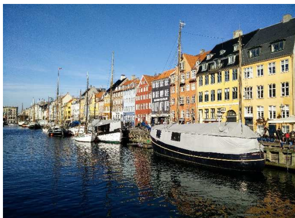
A typical postcard view of Copenhagen, Nyhavn and its colourful houses.