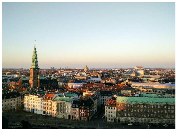
View of Copenhagen city at sunset.